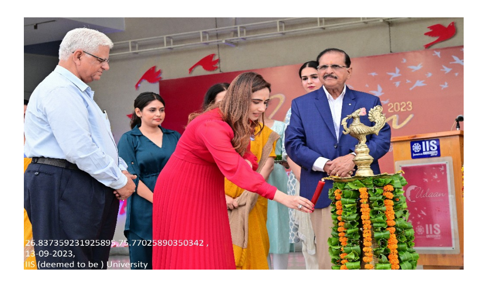
Lamp Lighting Ceremony with the Judges