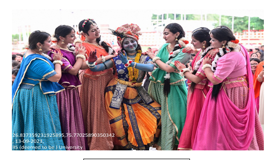
Dance performed by the Seniors