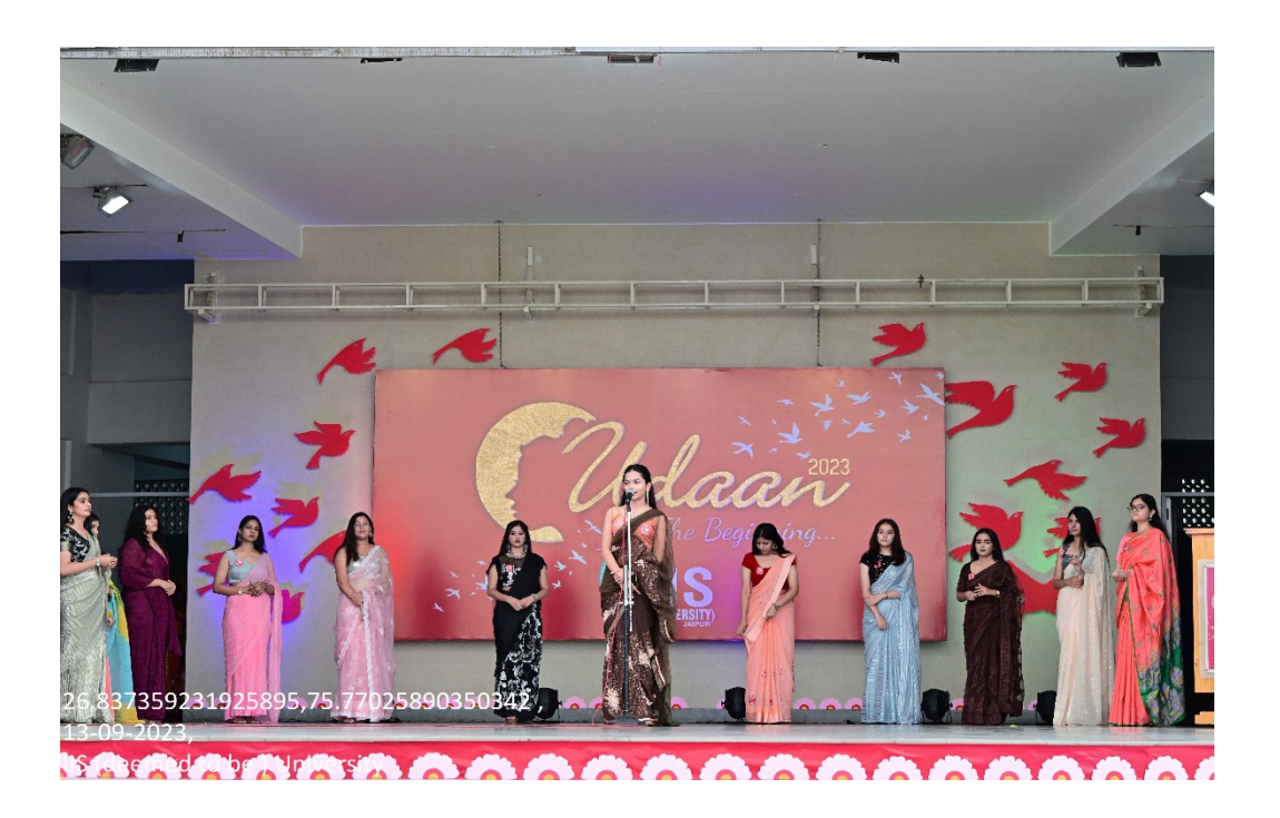
Ms. Fresher Under Graduate Round