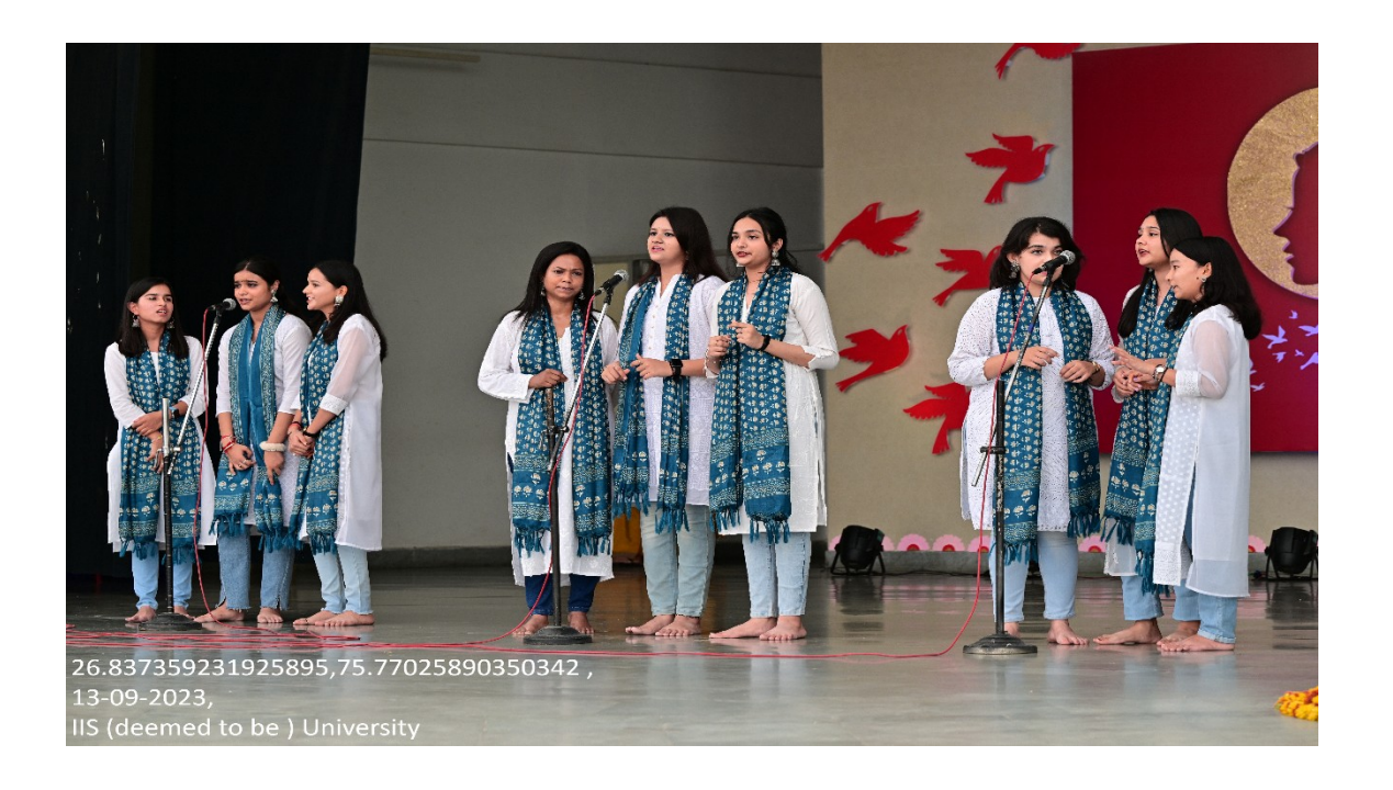
Singing Performance by Students