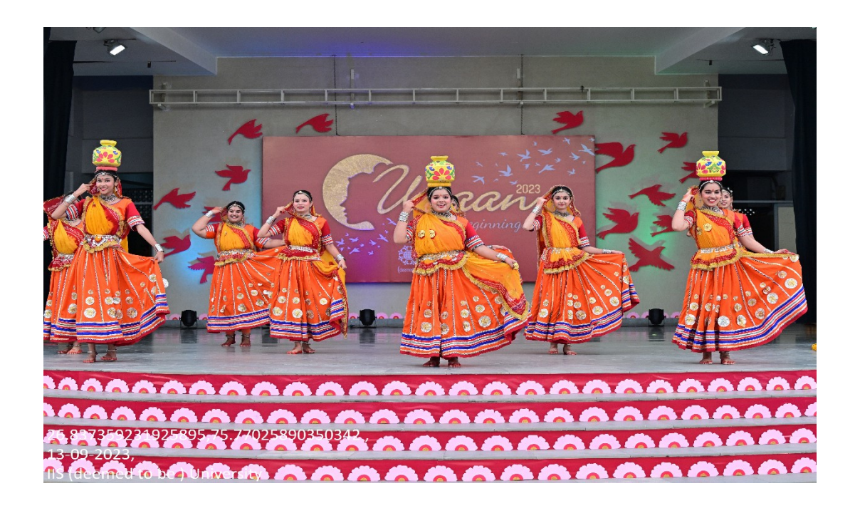
Folk – Dance performed by the students